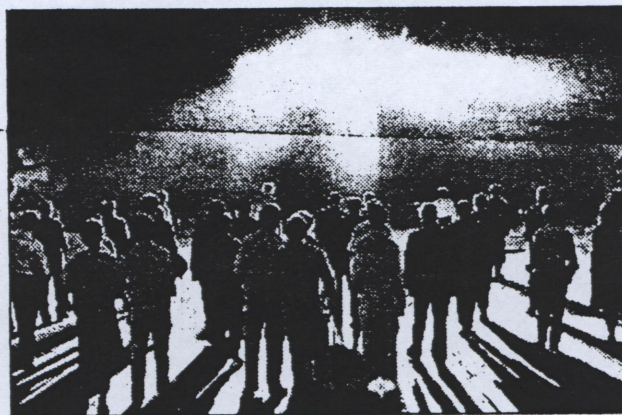
SCIENCE FICTION: How they saw it in Close Encounters

tors, or do they know something that the rest of us don't?